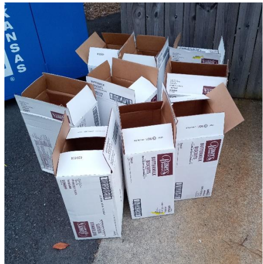
All that remains when you cook more than 1000 biscuits!