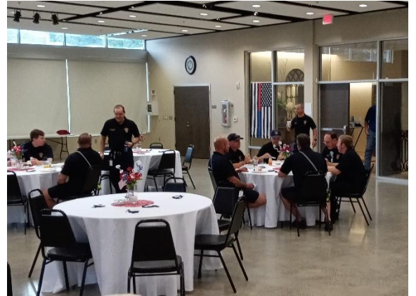
Firemen from Hot Springs Fire Department enjoying breakfast at St. Mary's.